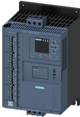
SIRIUS soft starter 200-480 V 38 A, 110-250 V AC Screw terminals