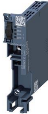
communication module PROFINET High-Feature with integrated switch