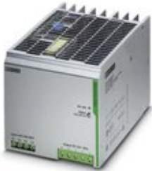
Primary-switched TRIO POWER power supply for DIN rail mounting, input: 3-phase, output: 24 V DC/40 A

Please be informed that the data shown in this PDF Document is generated from our Online Catalog. Please find the complete data in the user's documentation. Our General Terms of Use for Downloads are valid ( http://phoenixcontact.com/download )