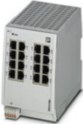
Managed Switch 2000, 16 RJ45 ports 10/100 Mbps, PROFINET Conformance-Class A

Please be informed that the data shown in this PDF Document is generated from our Online Catalog. Please find the complete data in the user's documentation. Our General Terms of Use for Downloads are valid ( http://phoenixcontact.com/download )