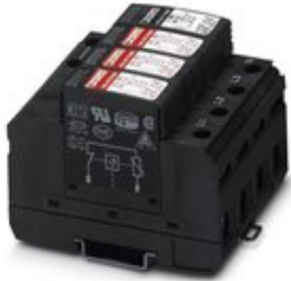
Surge protective device, 4-channel (in 3+1 circuit), for installation on NS 35/7,5 voltage: 230 V AC

Please be informed that the data shown in this PDF Document is generated from our Online Catalog. Please find the complete data in the user's documentation. Our General Terms of Use for Downloads are valid ( http://phoenixcontact.com/download )