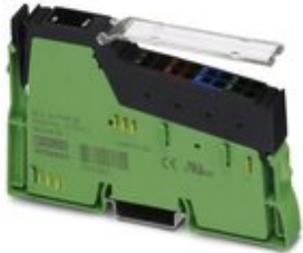
Inline power terminal, complete with accessories (connector and labeling field), 24 V DC, without fuse

Please be informed that the data shown in this PDF Document is generated from our Online Catalog. Please find the complete data in the user's documentation. Our General Terms of Use for Downloads are valid ( http://phoenixcontact.com/download )