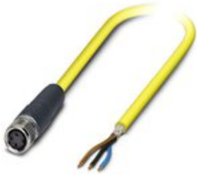
Sensor/actuator cable, 3-position, PVC, yellow, shielded, free cable end, on Socket straight M8, cable length: 5 m

Please be informed that the data shown in this PDF Document is generated from our Online Catalog. Please find the complete data in the user's documentation. Our General Terms of Use for Downloads are valid ( http://phoenixcontact.com/download )