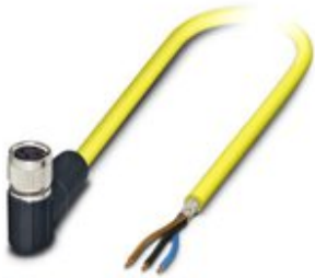
Sensor/actuator cable, 3-position, PVC, yellow, shielded, free cable end, on Socket angled M8, cable length: 2 m

Please be informed that the data shown in this PDF Document is generated from our Online Catalog. Please find the complete data in the user's documentation. Our General Terms of Use for Downloads are valid ( http://phoenixcontact.com/download )