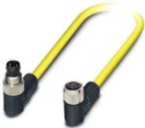
Sensor/actuator cable, 4-position, PVC, yellow, Plug angled M8, on Socket angled M8, cable length: 1.5 m

Please be informed that the data shown in this PDF Document is generated from our Online Catalog. Please find the complete data in the user's documentation. Our General Terms of Use for Downloads are valid ( http://phoenixcontact.com/download )