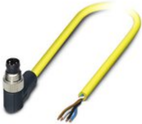
Sensor/actuator cable, 4-position, PVC, yellow, Plug angled M8, on free cable end, cable length: 5 m

Please be informed that the data shown in this PDF Document is generated from our Online Catalog. Please find the complete data in the user's documentation. Our General Terms of Use for Downloads are valid ( http://phoenixcontact.com/download )