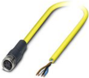
Sensor/actuator cable, 4-position, PVC, yellow, free cable end, on Socket straight M8, cable length: 5 m

Please be informed that the data shown in this PDF Document is generated from our Online Catalog. Please find the complete data in the user's documentation. Our General Terms of Use for Downloads are valid ( http://phoenixcontact.com/download )