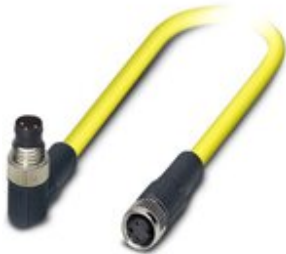
Sensor/actuator cable, 3-position, PVC, yellow, Plug angled M8, on Socket straight M8, cable length: 1.5 m

Please be informed that the data shown in this PDF Document is generated from our Online Catalog. Please find the complete data in the user's documentation. Our General Terms of Use for Downloads are valid ( http://phoenixcontact.com/download )