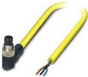
Sensor/actuator cable, 3-position, PVC, yellow, Plug angled M8, on free cable end, cable length: 2 m

Please be informed that the data shown in this PDF Document is generated from our Online Catalog. Please find the complete data in the user's documentation. Our General Terms of Use for Downloads are valid ( http://phoenixcontact.com/download )