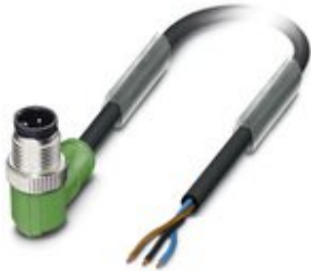
Sensor/actuator cable, 3-position, PVC, black RAL 9005, Plug angled M12, coding: A, on free cable end, cable length: 10 m

Please be informed that the data shown in this PDF Document is generated from our Online Catalog. Please find the complete data in the user's documentation. Our General Terms of Use for Downloads are valid ( http://phoenixcontact.com/download )