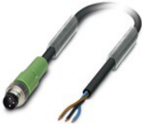
Sensor/actuator cable, 3-position, PVC, black RAL 9005, Plug straight M8, on free cable end, cable length: 1.5 m

Please be informed that the data shown in this PDF Document is generated from our Online Catalog. Please find the complete data in the user's documentation. Our General Terms of Use for Downloads are valid ( http://phoenixcontact.com/download )