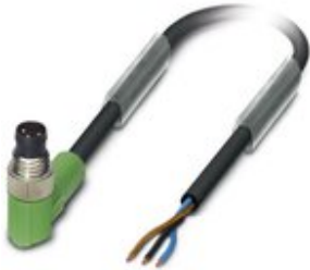
Sensor/actuator cable, 3-position, PVC, black RAL 9005, Plug angled M8, on free cable end, cable length: 1.5 m

Please be informed that the data shown in this PDF Document is generated from our Online Catalog. Please find the complete data in the user's documentation. Our General Terms of Use for Downloads are valid ( http://phoenixcontact.com/download )