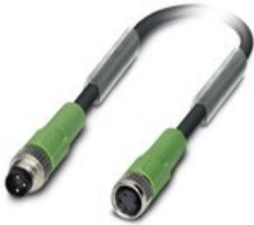
Sensor/actuator cable, 3-position, PVC, black RAL 9005, Plug straight M8, on Socket straight M8, cable length: 1.5 m

Please be informed that the data shown in this PDF Document is generated from our Online Catalog. Please find the complete data in the user's documentation. Our General Terms of Use for Downloads are valid ( http://phoenixcontact.com/download )