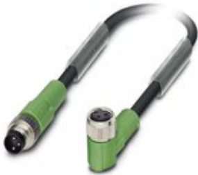
Sensor/actuator cable, 3-position, PVC, black RAL 9005, Plug straight M8, on Socket angled M8, cable length: 0.3 m

Please be informed that the data shown in this PDF Document is generated from our Online Catalog. Please find the complete data in the user's documentation. Our General Terms of Use for Downloads are valid ( http://phoenixcontact.com/download )