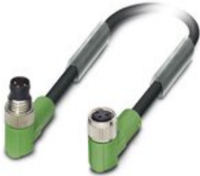
Sensor/actuator cable, 3-position, PVC, black RAL 9005, Plug angled M8, on Socket angled M8, cable length: 1.5 m

Please be informed that the data shown in this PDF Document is generated from our Online Catalog. Please find the complete data in the user's documentation. Our General Terms of Use for Downloads are valid ( http://phoenixcontact.com/download )