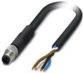
Sensor/actuator cable, 4-position, PUR, black RAL 9005, Plug straight M5, coding: A, on free cable end, cable length: 1.5 m

Please be informed that the data shown in this PDF Document is generated from our Online Catalog. Please find the complete data in the user's documentation. Our General Terms of Use for Downloads are valid ( http://phoenixcontact.com/download )