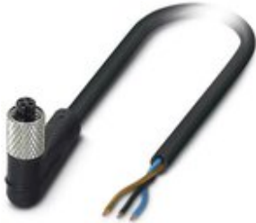
Sensor/actuator cable, 3-position, PUR, black RAL 9005, free cable end, on Socket angled M5, coding: A, cable length: 5 m

Please be informed that the data shown in this PDF Document is generated from our Online Catalog. Please find the complete data in the user's documentation. Our General Terms of Use for Downloads are valid ( http://phoenixcontact.com/download )