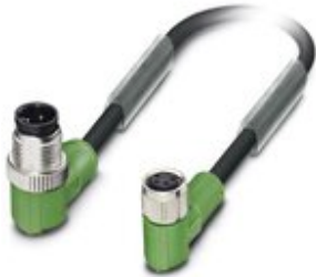
Sensor/actuator cable, 4-position, PUR halogen-free, black-gray RAL 7021, Plug angled M12, coding: A, on Socket angled M8, cable length: 0.3 m

Please be informed that the data shown in this PDF Document is generated from our Online Catalog. Please find the complete data in the user's documentation. Our General Terms of Use for Downloads are valid ( http://phoenixcontact.com/download )