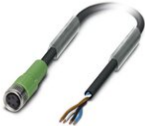
Sensor/actuator cable, 4-position, PUR halogen-free, black-gray RAL 7021, free cable end, on Socket straight M8, cable length: 5 m

Please be informed that the data shown in this PDF Document is generated from our Online Catalog. Please find the complete data in the user's documentation. Our General Terms of Use for Downloads are valid ( http://phoenixcontact.com/download )