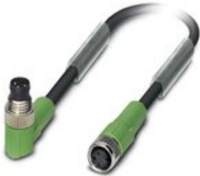
Sensor/actuator cable, 3-position, PUR halogen-free, black-gray RAL 7021, Plug angled M8, on Socket straight M8, cable length: 3 m

Please be informed that the data shown in this PDF Document is generated from our Online Catalog. Please find the complete data in the user's documentation. Our General Terms of Use for Downloads are valid ( http://phoenixcontact.com/download )