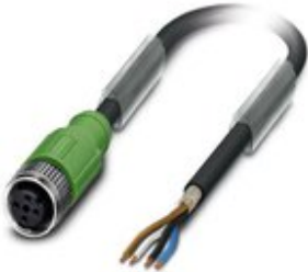
Sensor/actuator cable, 4-position, PUR halogen-free, black-gray RAL 7021, shielded, free cable end, on Socket straight M12, coding: A, cable length: 3 m

Please be informed that the data shown in this PDF Document is generated from our Online Catalog. Please find the complete data in the user's documentation. Our General Terms of Use for Downloads are valid ( http://phoenixcontact.com/download )