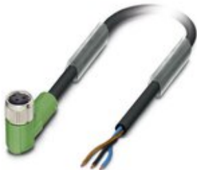
Sensor/actuator cable, 3-position, PUR halogen-free, black-gray RAL 7021, free cable end, on Socket angled M8, cable length: 10 m

Please be informed that the data shown in this PDF Document is generated from our Online Catalog. Please find the complete data in the user's documentation. Our General Terms of Use for Downloads are valid ( http://phoenixcontact.com/download )