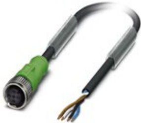
Sensor/actuator cable, 4-position, PUR halogen-free, black-gray RAL 7021, free cable end, on Socket straight M12, coding: A, cable length: 10 m

Please be informed that the data shown in this PDF Document is generated from our Online Catalog. Please find the complete data in the user's documentation. Our General Terms of Use for Downloads are valid ( http://phoenixcontact.com/download )