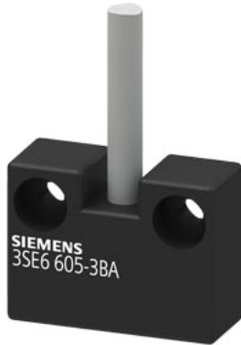
Contact block rectangular small 25 x 33 mm, 1 NO+1 NC, 10 m cable