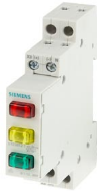
Light Indicators 3x LED 12..60V red / green / yellow