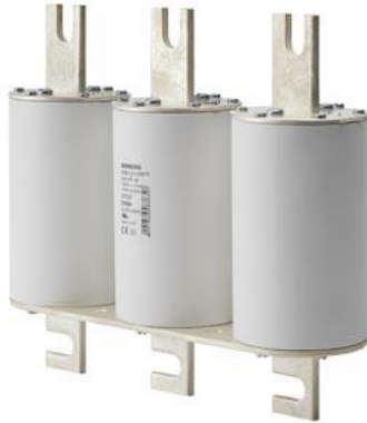
SITOR fuse link, with slotted blade contacts, 3 x NH3L, In: 2400 A, aR, Un DC: 1250 V, front indicator