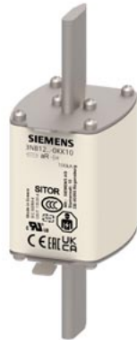
SITOR fuse size 2 450A aR 440V dc/500V VSI 500V dc UL @MBC 6xIn blade contacts