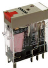
G2R-2-SNI 24VAC (S) Relay, plug-in, 8-pin, DPDT, 5 A, mech & LED indicators, lockable test button, label facility