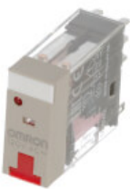
G2R-2-SNI 120VAC (S) Relay, plug-in, DPDT, 5 A, mech. & LED indicator, test button, 120 VAC