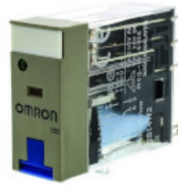
G2R-2-SNI 12VDC (S) Relay, plug-in, 8-pin, DPDT, 5 A, mech & LED indicators, lockable test button, label facility, 12 VDC