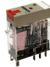
G2R-2-SNI 110VAC (S) Relay, plug-in, 8-pin, DPDT, 5 A, mech & LED indicators, lockable test button, label facility