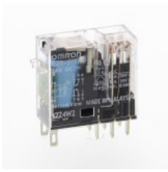
G2R-2-SND 24VDC (S) Relay, plug-in, 8-pin, DPDT, 5 A, mech & LED indicators, coil suppressor, label facility