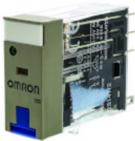
G2R-2-SNDI 24VDC (S) Relay, plug-in, 8-pin, DPDT, 5 A, mech & LED indicators, coil suppressor, lockable test button, label facility