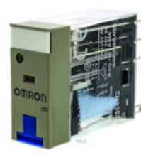
G2R-2-SNDI 12VDC (S) Relay, plug-in, 8-pin, DPDT, 5 A, mech & LED indicators, coil suppressor, lockable test button, label facility, 12 VDC.