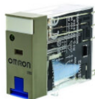
G2R-2-SNI 24VDC (S) Relay, plug-in, 8-pin, DPDT, 5 A, mech & LED indicators, lockable test button, label facility