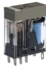
G2R-2-SND-AP3 24VDC (S) Relay, plug-in, 8-pin, DPDT, 5 A, gold-plated contacts, mech & LED indicators, coil suppressor, label facility