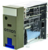
G2R-2-SNDI-AP3 24VDC (S) Relay, plug-in, 8-pin, DPDT, 5 A, mech & LED indicators, coil suppressor, label test button, Au-plating