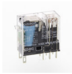
G2R-2-SND 48VDC (S) Relay, plug-in, 8-pin, DPDT, 5 A, mech & LED indicators, coil suppressor, label facility, 48 VDC