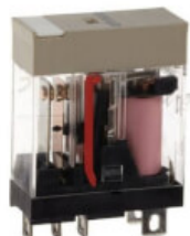
G2R-1-S 230VAC (S) Relay, plug-in, 5-pin, SPDT, 10 A, mech indicator, label facility, 230 VAC