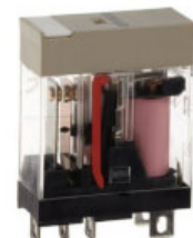
G2R-1-S 24VAC (S) Relay, plug-in, 5-pin, SPDT, 10 A, mech indicator, label facility, 24 VAC