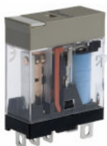
G2R-1-S 12VDC (S) Relay, plug-in, SPDT, 10 A, mechanical indicator, 12 VDC