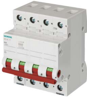
switch disconnecter, on-off switch 63 A 3-pole + N, with red handle