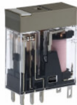
G2R-2-S 220VAC (S) Relay, plug-in, 5 A, mechanical indicator, 220 VAC