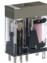
G2R-2-S 230VAC (S) Relay, plug-in, DPST, 10 A, mechanical indicator, 230 VAC