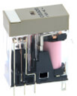
G2R-2-S 110VAC (S) Relay, plug-in, DPDT, 5 A, mechanical indicator, 110 VAC