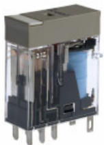
G2R-2-S 12VDC (S) Relay, plug-in, 8-pin, DPDT, 10 A, mech indicator, label facility, 12 VDC