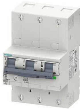
Main miniature circuit breaker (SHU), 3-pole, E 25, 400V