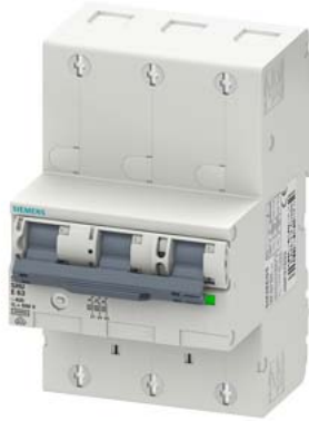
Main miniature circuit breaker (SHU), 3-pole, E 63, 400V