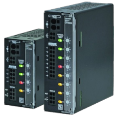
Electronic Circuit Breaker S8V-CP - Electronic Circuit Breaker