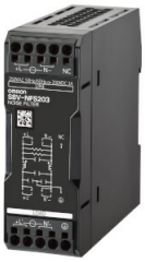
S8V-NF Noise Filter S8V-NF