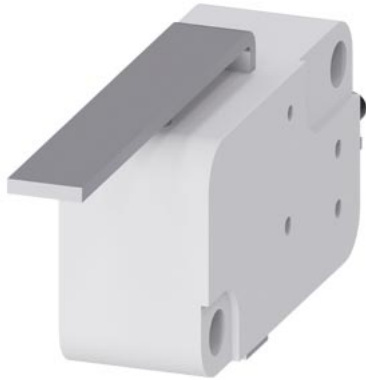
Accessory Circuit breaker 3WA, Ready-to-close signaling switch S20