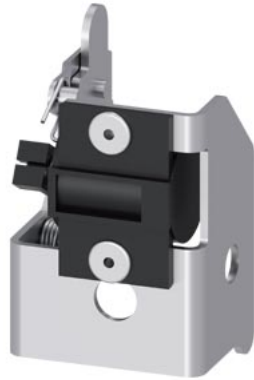
Accessory Circuit breaker 3WA, Operations counter for electrically operated circuit breaker