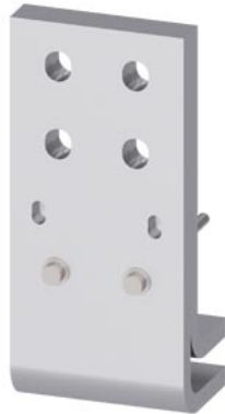
Accessory Circuit breaker 3WA, Front connection DIN 43676 double hole, top or bottom frame size 2 - 2500 A for circuit breaker in withdrawable design, 1 piece