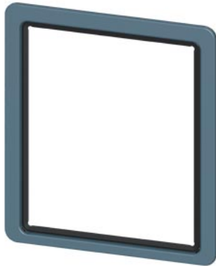
Accessory Circuit breaker 3WA, door sealing frame IP41 Spare part for Z-option T40