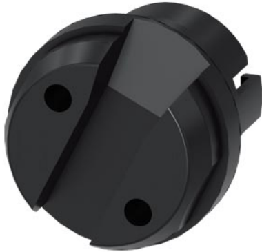
Accessory Circuit breaker 3WA, Coupling on the circuit breaker for mutual interlocking with bowden cable