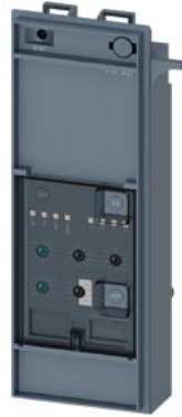
Accessory circuit breaker 3WA, Electronic Trip Unit ETU300 LSI / LSIG