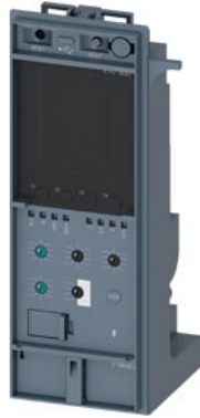
Accessory circuit breaker 3WA, Electronic Trip Unit ETU600 LSI / LSI G