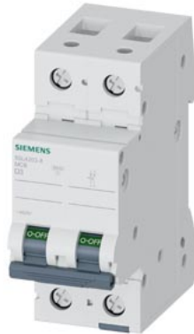
Miniature circuit breaker 400 V 10kA, 2-pole, D, 3A