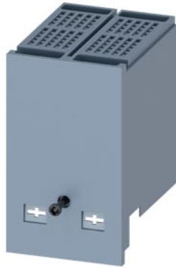
terminal cover extended 2-pole; 1 unit accessory for: 3VA51