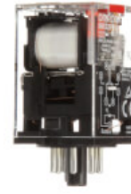
MKS2PIN 110VAC Relay, plug-in, 8-pin, DPDT, 10 A, mech & LED indicator, test button