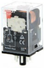
MKS2P 230VAC Relay, plug-in, 8-pin, DPDT, 10 A, mech indicator