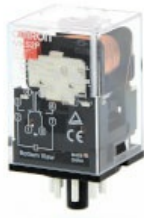
MKS2P 24VDC Relay, plug-in, 8-pin, DPDT, 10 A, mech indicator