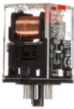
MKS2PI 24VAC Relay, plug-in, 8-pin, DPDT, 10 A, mech indicator, test button