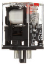
MKS2PIN 230VAC Relay, plug-in, 8-pin, DPDT, 10 A, mech & LED indicator, test button