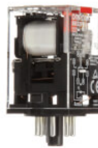
MKS2PIN 24VAC Relay, plug-in, 8-pin, DPDT, 10 A, mech & LED indicator, test button