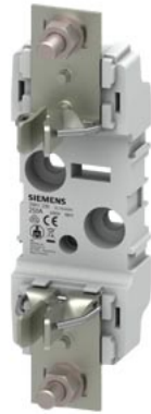
HRC fuse base plastic Sz. 1 1-pole 250A 690V flat terminal