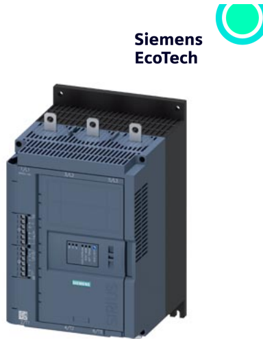
SIRIUS soft starter 200-600 V 171 A, 24 V AC/DC Screw terminals Analog output